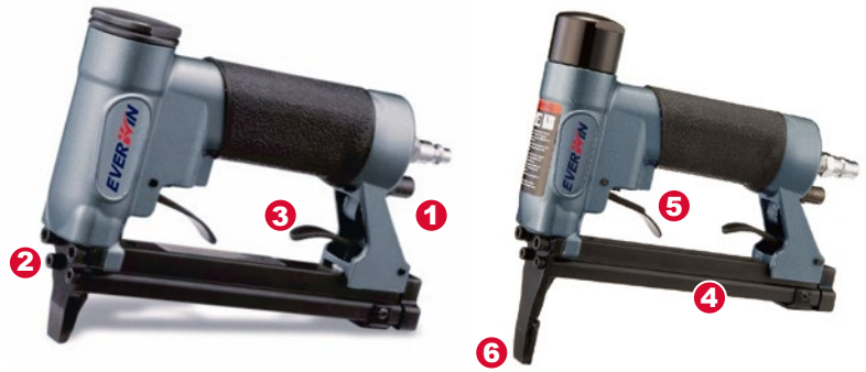
US series Single fire, short nose